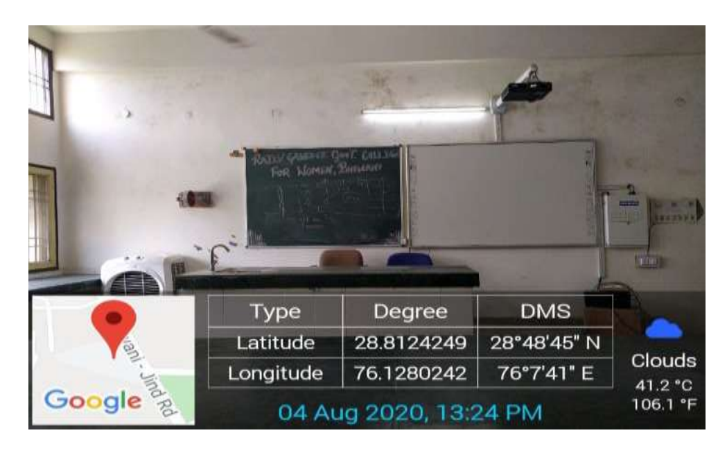
Room No. 20

Website: www.gcwbhiwani.com Email: gcwbhiwani@gmail.com