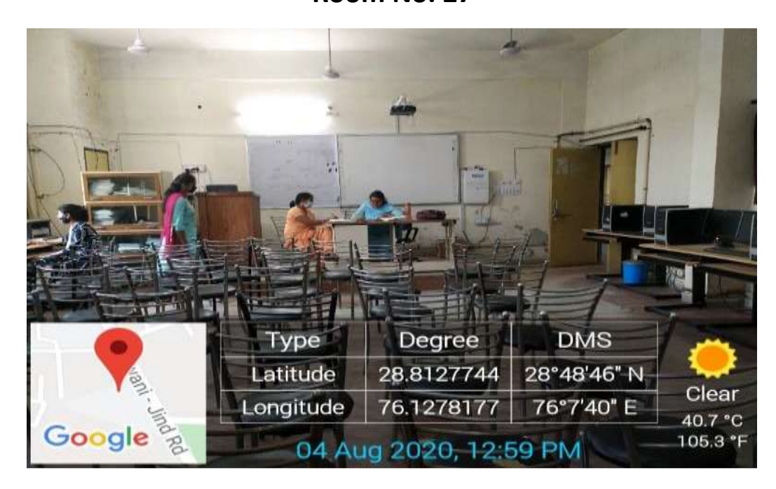
Room No. 28

Website: www.gcwbhiwani.com Email: gcwbhiwani@gmail.com