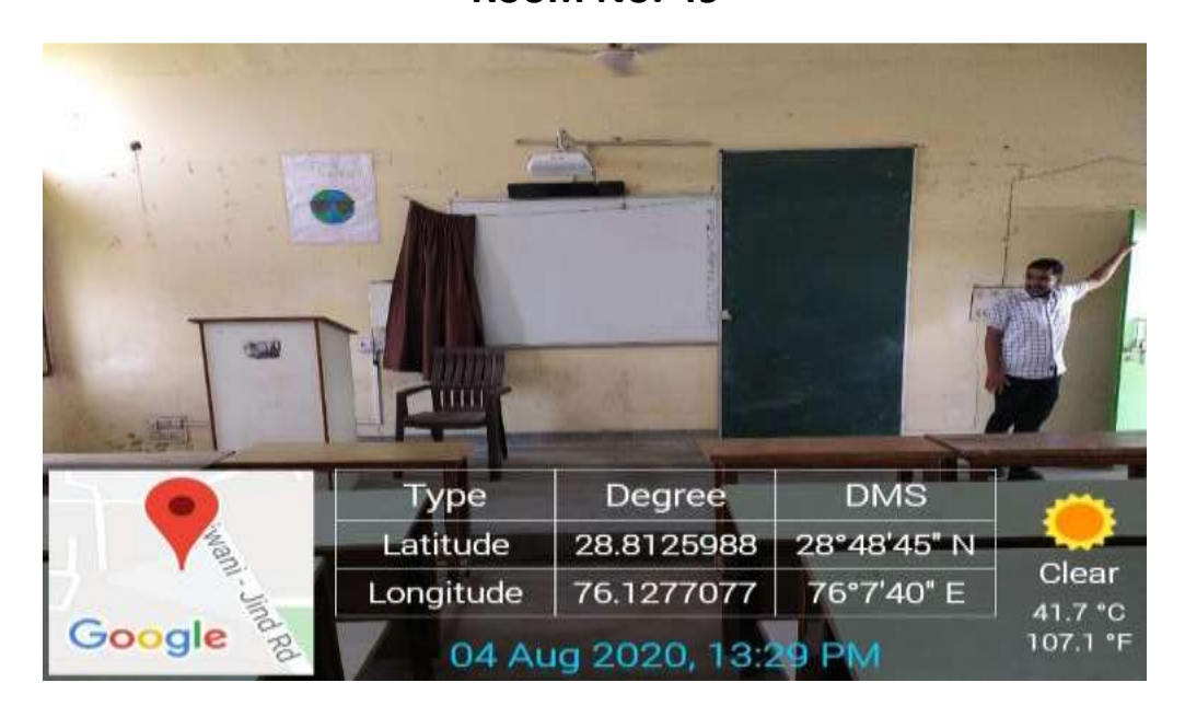
Room No. 33

Website: www.gcwbhiwani.com Email: gcwbhiwani@gmail.com