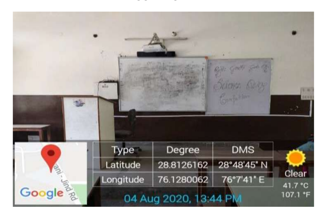
Room No. 29

Website: www.gcwbhiwani.com Email: gcwbhiwani@gmail.com