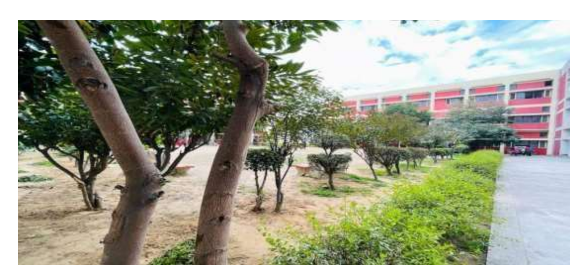
Trees on Campus

Website:- www.gcwbhiwani.ac.in Email:- gcwbhiwani@gmail.com